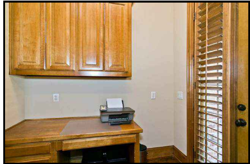
Administrative Suite within Study and Private Access to outside.