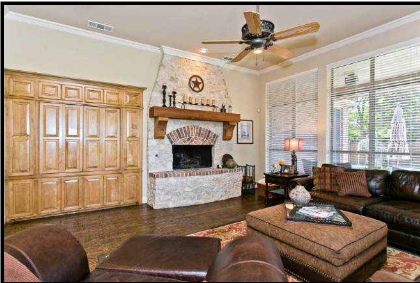
Family Room with Flagstone Fire Place, Cedar Mantle, Remote Gas Starter & Custom Entertainment Center