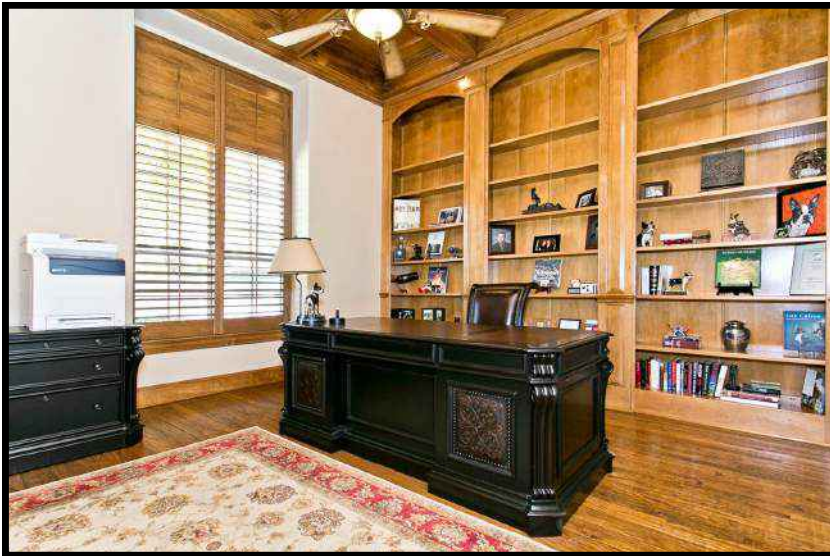
Study with Maple Woodwork & Plantation Shutters Coffered Ceiling, Custom Built-ins