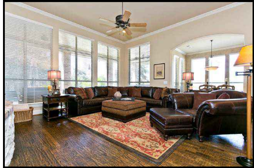
Family Room with Hand Scraped Hardwoods, Wall of Windows with Magnificent View of Pool Area