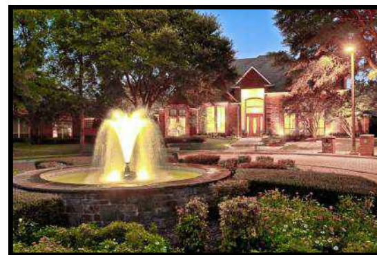
Amazing Twilight ambiance!

5 Bedroom/One works well as Study /3.5Bath /Formal Living /Formal Dining /Family /Kitchen /Breakfast /Oversized 3 Car Garage