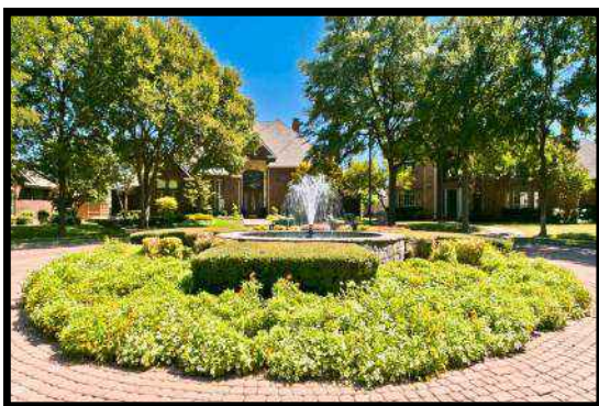
Beautiful Fountain & Circle Drive

Plano ISD: Elementary School: Daffron Middle School: Robinson High School: Jasper Senior High: Plano West